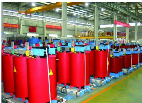
SC(B) Series Cast Resin/Epoxy Transformer